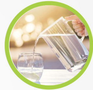
Potable Drinking Water