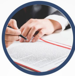
Clear Titled Document